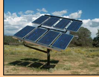
Universal Track Rack<sup>tm</sup> Model UTRK-040