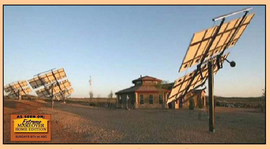
ABC EXTREME MAKEOVER "YAZZIE FAMILY" HOME FEATURING ZOMEWORKS UNIVERSAL TRACK RACK<sup>TM</sup> MODEL UTRF-168 "THE EARLY BIRD'S VIEW" INSTALLED BY MARK SNYDER ELECTRIC

Incorporating over three decades of tracker design and fabrication experience, the UTRF Series Tracker is our most popular design for large arrays. It features sturdy welded-steel construction, pre-assembled bolt-together components, sealed-axle ball bearings, heavy-duty shock absorbers, and early morning wake-up fin to catch the first sunlight of the day. Our UTRK-040 and our UTR-020 are perfect for small PV systems and pumps.